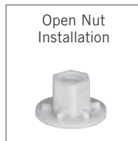
Open Nut Installation

For use with bolt caps. Fits ½" sockets.